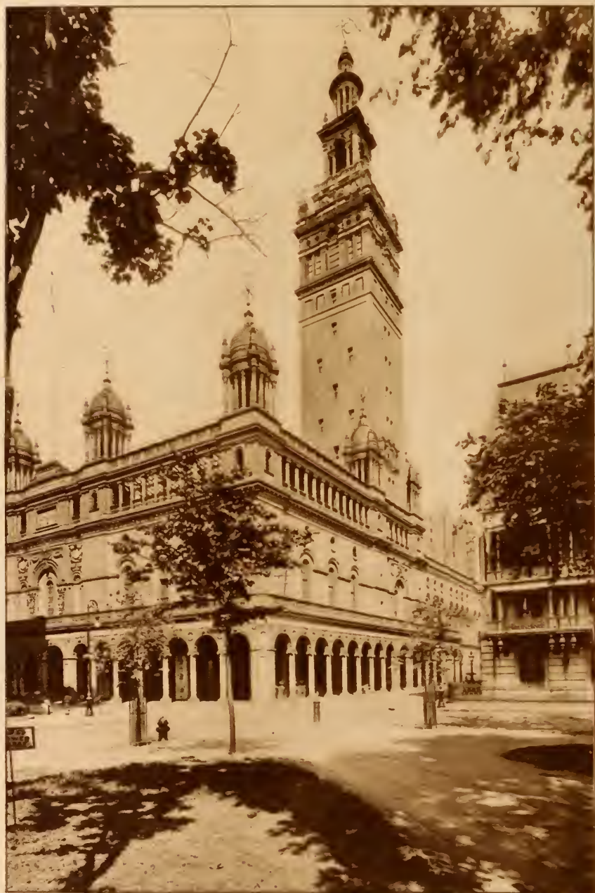
MADISON SQUARE GARDEN. Most famous convention and exposition hall in the world. Seating capacity 12,000. Tower 341 feet high.